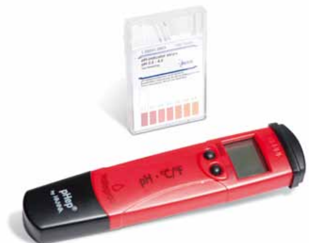
Figure 1: pH measuring by digital measurement or litmus paper.